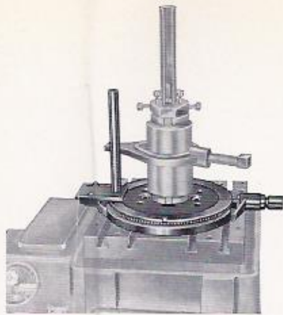
Dividing Attachment TA 80

A tilting table can be supplied for keywaying taper bores parallel to the bore wall. It is mounted on the table of the machine and tilts up to 6°.